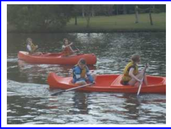
Canoeing was one of the highlights.